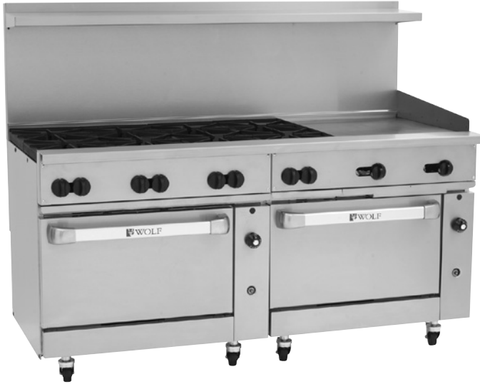
Model C72SS-8B-24G-N (shown with optional casters)