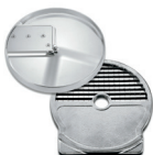
WFP16S13 Dicing Assembly