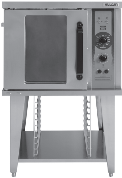
Model ECO2D shown on optional stainless steel stand