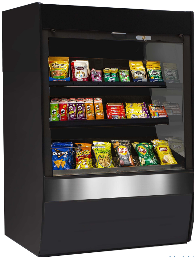
Model VNSS3660S Shown

Designed with impulse sales in mind. Get maximum return from an attention-grabbing merchandiser and increase profits.