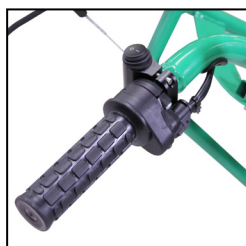
Twist Throttle Handle