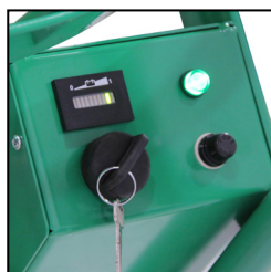
Battery Display Gauge