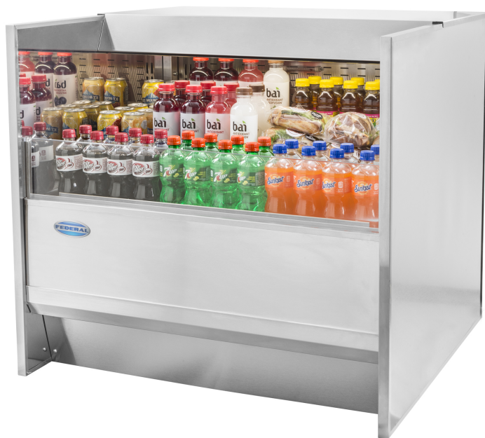
Shown with optional accessories

Incorporate into your own counter to drive product sales. The under-counter merchandiser will entice customers with last minute impulse sales through visual appeal.