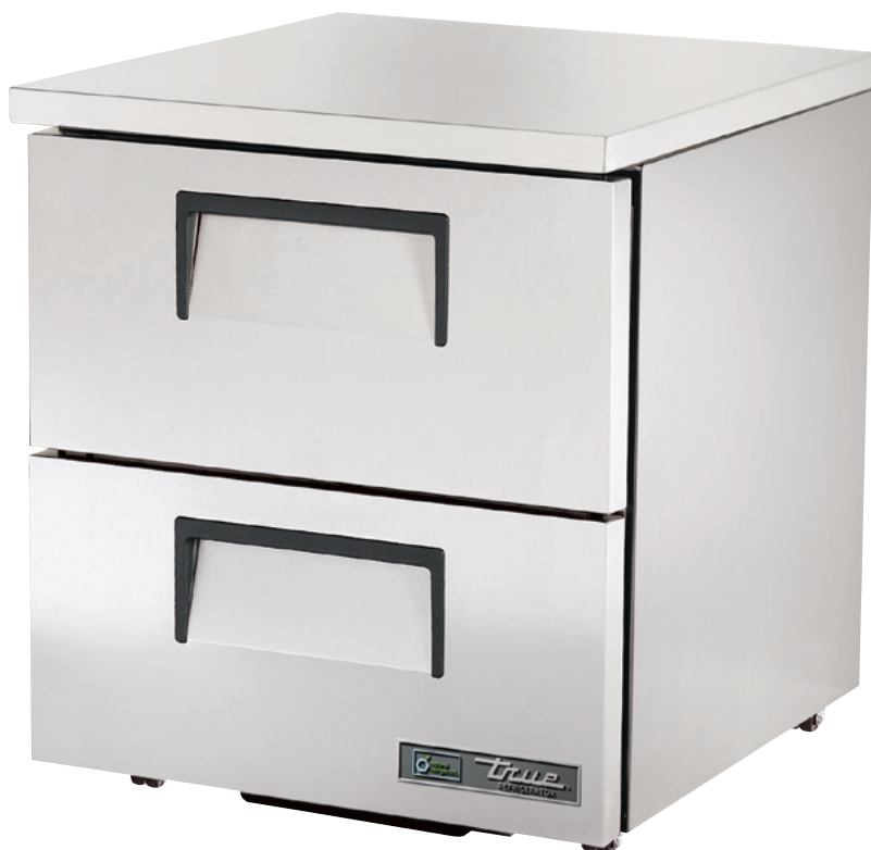
ADA & Low Profile Comparison

Low Profile Drawered Refrigerator with Hydrocarbon Refrigerant