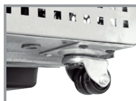
1 1/2" diameter dual swivel castors for "LP" models.