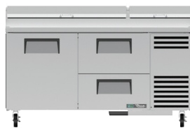
Straight-On Front View