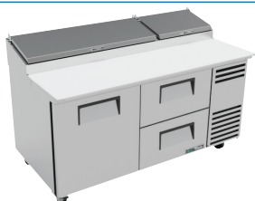
Front Left View