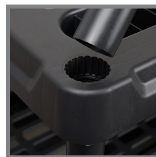
ASSEMBLES IN MINUTES