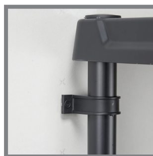
WALL-MOUNTING BRACKETS FOR STABILITY