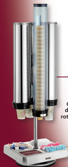
Cup and cone dispensers and rotary stands sold separately.

Countertop rotating stands for cup, tubular lid, and ice cream cone dispensers. Dispensers sold separately.