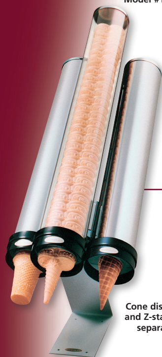
Cone dispensers and Z-stand sold separately.

Prevent breakage, protect from contamination, and keep ice cream cones fresher with the Simpli-Flex® Cone Dispensers for cake, waffle, and sugar cones with a 1-3/8" – 3-3/8" (35 – 86 mm) cone lip diameter. Simpli-Flex Cone Dispensers are completely self-adjusting, ensuring one-at-a-time dispensing. Available in heavy-duty, polished stainless steel or tough gray-tinted plastic. Dispenser mount options include wall, stand, in-counter, or under-counter.