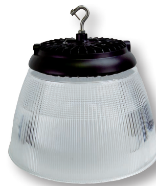
LED Round High Bay with acrylic refractor