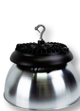
LED Round High Bay with aluminum reflector