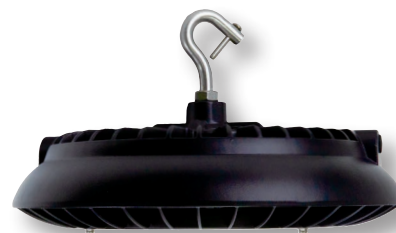
LED Round High Bay

Input Line Voltage ..... 120-277VAC or 347/480VAC Input Line Frequency (Hz) ..... 50/60HZ Wattage (W)..... 80W/100W/150W/200W Lumens (L)..... 13200L/16500L/24750L/33000L Lumens per Watt (LPW)..... >165 LPW Rated Life..... 50,000 hours Minimum Starting Temperature ..... -40°C (-22°F) Maximum Operating Temperature..... 50°C (122°F) CRI ..... >80 Power Factor ..... >0.95 THD..... <20% Surge Protection ..... 4kV Ratings ..... cULus wet location rated, IP65 Controls..... 0-10V dimming (standard)