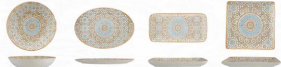
COUPE DEEP PLATE

Ø 26cm | 6 ☉ DPRARN05Z012026 Ø 23cm | 12 ☉ DPRARN05Z012023