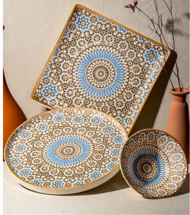
The contents of this catalogue may be changed or cancelled at the discretion of the ARIANE management without prior notice.

In the printing of this brochure, every effort has been made to ensure perfect reproduction of product colours, but due to printing limitations, they may not be an exact match to the actual product.