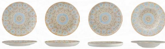
ROUND RIMLESS PLATE

Ø 27cm | 6 ☉ DVCARN05Z011027 Ø 24cm | 6 ☉ DVCARN05Z011024 Ø 21cm | 12 ☉ DVCARN05Z011021 Ø 18cm | 12 ☉ DVCARN05Z011018