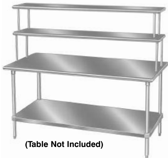
(Table Not Included)