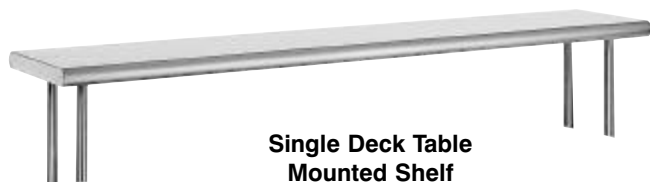
Single Deck Table Mounted Shelf

Specify location. Front, Center or Rear.