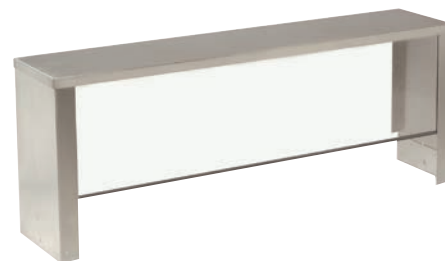
10" Wide Serving Shelf With Built-In Food Shield