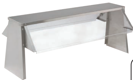
10" Wide Buffet Shelf With Built-In Food Shield