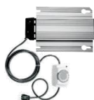
Heating Element (Item #9506/1)