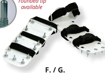
F. / G.