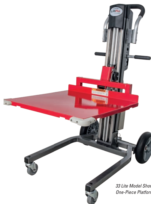
33 Lite Model Shown with Optional One-Piece Platform (P/N 536130)

The Versatile All-In-One System That Lifts... Plus So Much More!