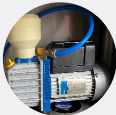
1/3 HP Vacuum Pump