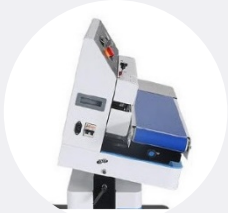
Tilting seal head – up to 30 degrees