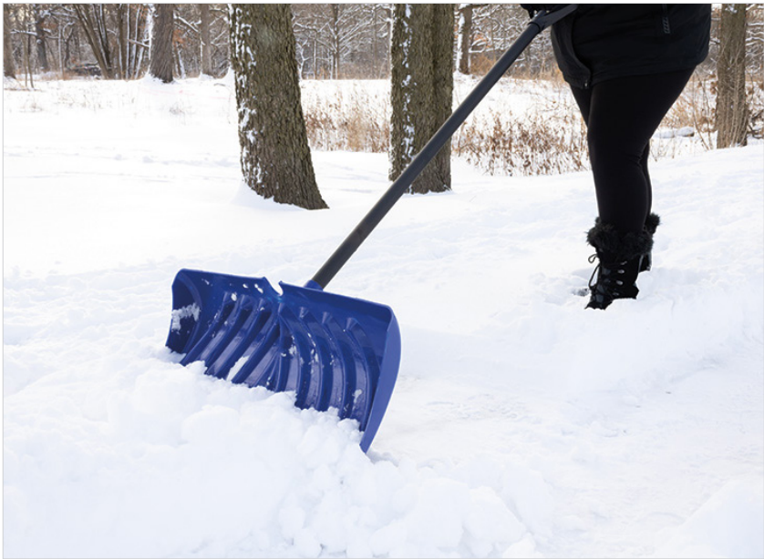
RIBBED STEEL CORE® SHAFT