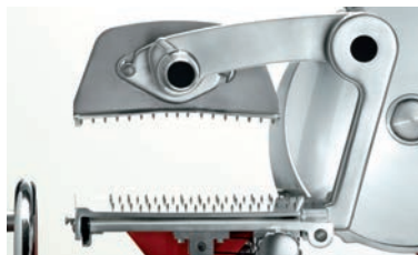
Lateral movement with a clamping arm to slide product through