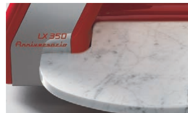
Marble receiving tray option for Anniversario LX 350 only