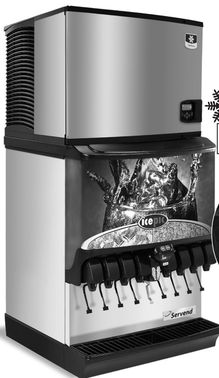
Selectable SV-250 Ice/Beverage Dispenser with Indigo Ice Machine