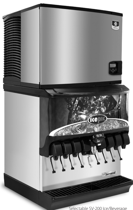
Selectable SV-200 Ice/Beverage Dispenser with S500 Ice Machine

SV-200 • SV-250 Selectable Ice/Beverage Dispensers with Ice Crusher