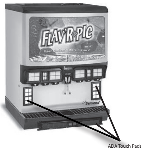
ADA Touch Pads

ADA unit includes push button branded syrup selection on back splash panel and flavor shots as well as icepic ice selection on counter-mounted ADA service bar in front of machine. Check your local requirements regarding ADA compliance.