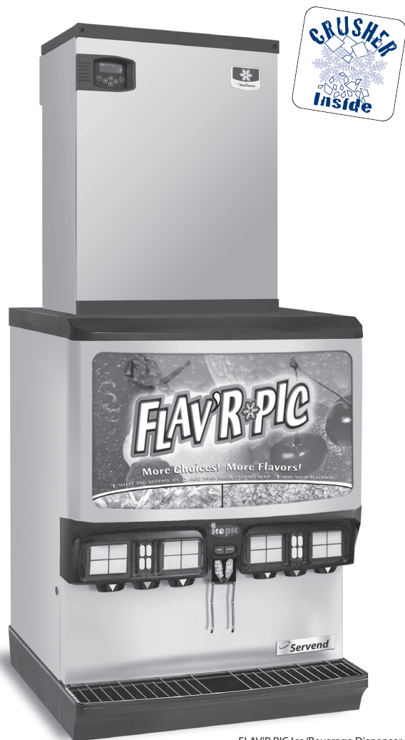
FLAV'R PIC Ice/Beverage Dispenser with IB-800 Ice Machine

FLAV'R PIC™ 250 Multi-flavor Ice/Beverage Dispenser with Selectable Ice