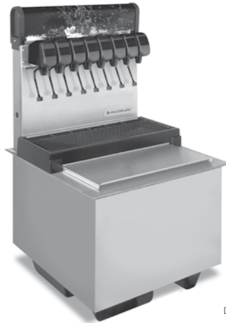
DI-2323-8-SL Shown with 464GP Valves