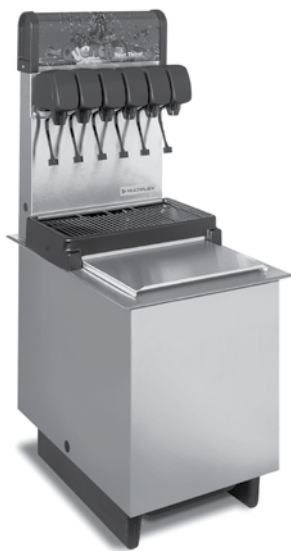
DI-1522-6-SL Shown with 464GP Valves