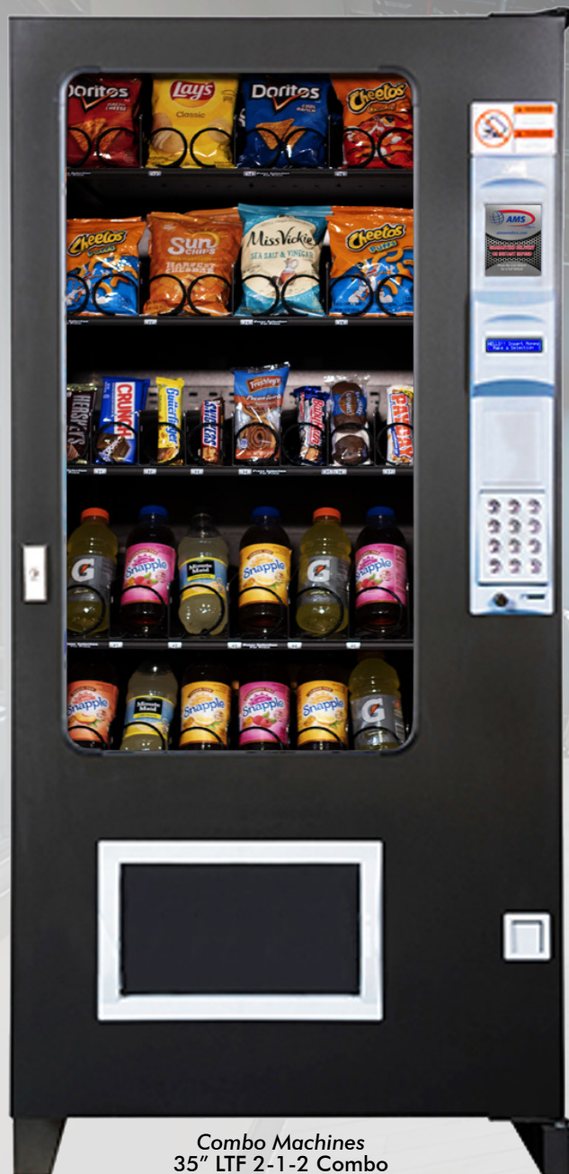
Combo Machines 35" LTF 2-1-2 Combo 35" LTF 2-1-1-SCCD

The refrigerated LTF is an exceptional addition to your vending portfolio for perishable food, snacks, beverages, or a combination of all of them. Whether providing to those that cannot leave over lunch, or for locations that want the convenience of food, snacks, and beverages the LTF offers the solution where your customers live or work. Let the LTF feed your customers cravings.