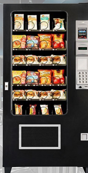
Food Machines 35 LTF 6F 35 LTF 5F 1B