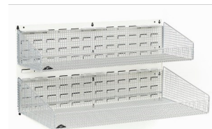
QB3619WP with One QB1236 One QB1836