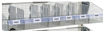
QB36LHC Clear Label Holder (shown with labels)