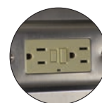
15A - 120V GFI Duplex Receptacle Hidden Beneath Blender Shelf