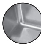
Deep Drawn Seamless Sink Bowl