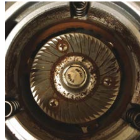
UNCLEAN GRINDER BURRS

Grinding roasted coffee beans will eventually wear the burrs in the grinder. Research indicates though that Cafetto Grinder Clean is less abrasive to the burrs than roasted coffee beans. To prove this, we tested to compare the hardness or breaking force of medium roasted coffee beans to Grinder Clean pellets. The measure of hardness used is the International System of Units measure known as the Newton (N). The results are shown in the chart below.