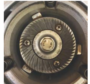
AFTER 45G GRINDER CLEAN