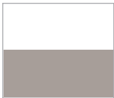
Glacier White/ Linen

Moon armchair features a low backrest with a wide ergonomic seat. Easy to handle and move around patios and terraces.