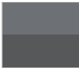
Titanium Gray/ Charcoal