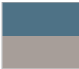
Storm Blue/ Linen