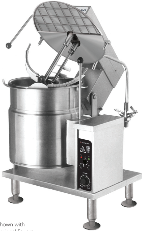
Shown with optional Faucet