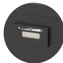
Visual and audible low voltage alert