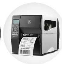
PowerPack 4.0 powers mid-range printer for 6-8 hours (dependent on number of labels printed)