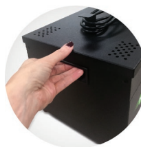
Easy grip side handles for true portability