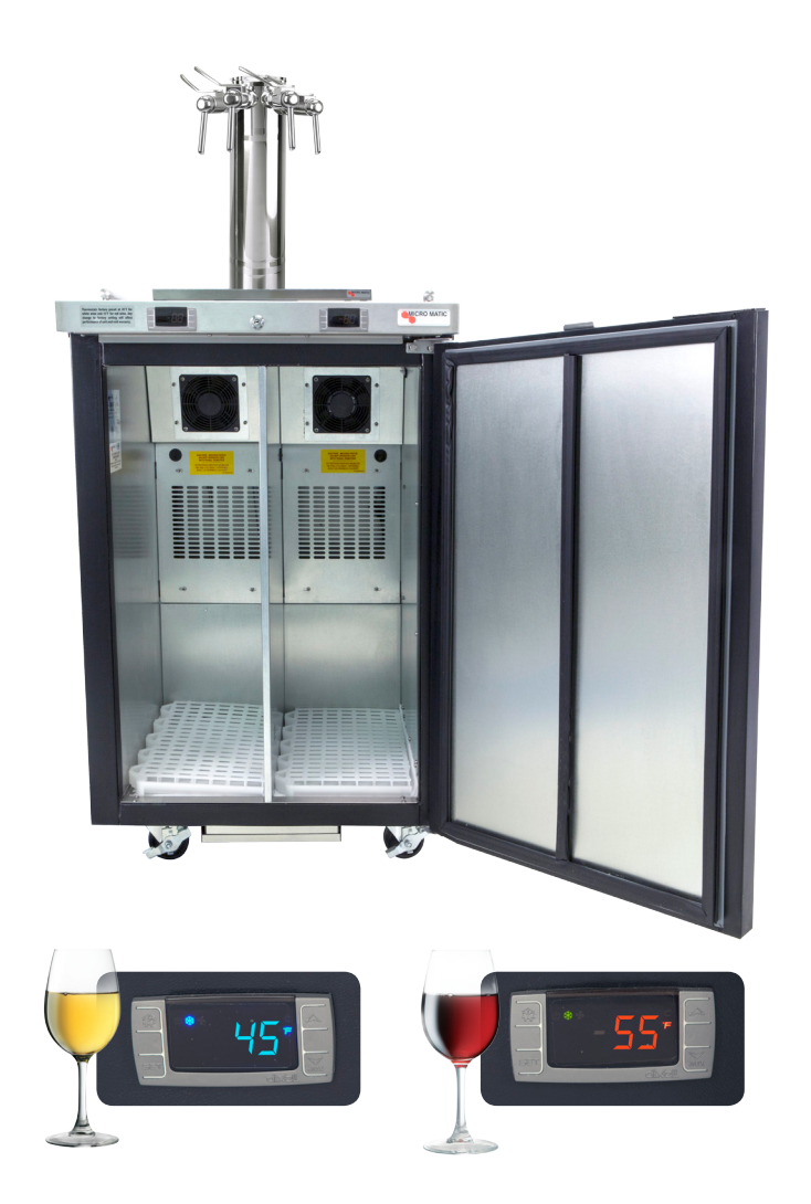
Dual-Temperature: Built In Digital Thermostats