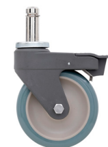
5PCBXM Antimicrobial Tread Swivel Brake