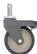
5PCBX Swivel & Brake