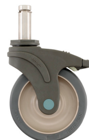
5PSTEBX Total Lock