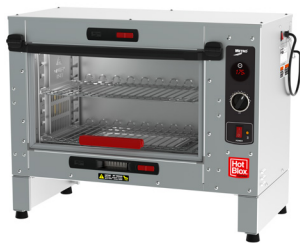
Riser Kit (customer must install) HBCS-RISER