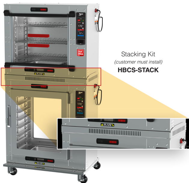
Stacking Kit (customer must install) HBCS-STACK