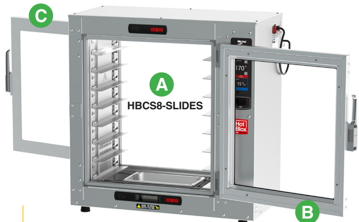
Pass-thru unit shown with optional doors & pan slides.