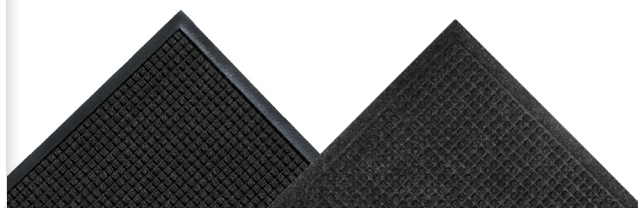
Fashion Fabric Border