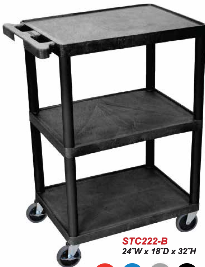
STC222-B 24"W x 18"D x 32"H