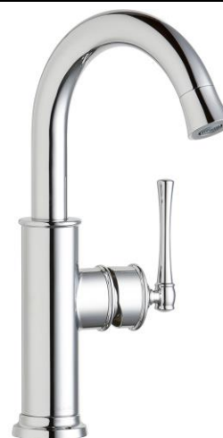
Lustrous Steel (LS)