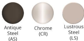
Antique Steel (AS)

LK130 - Elkay 3-Hole Deck Plate/Escutcheon, Lustrous Steel (LS)