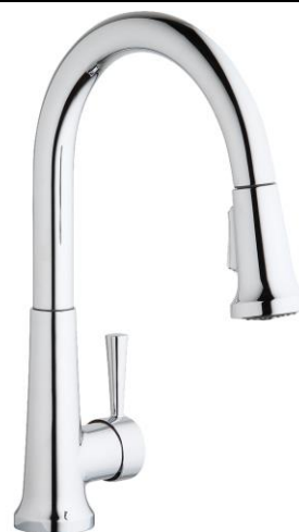
Lustrous Steel (LS)