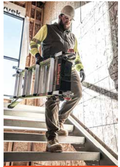
Stays Secured During Transport