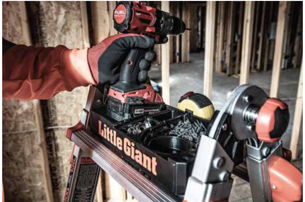
Magnetic, Holster and Compartment Tray