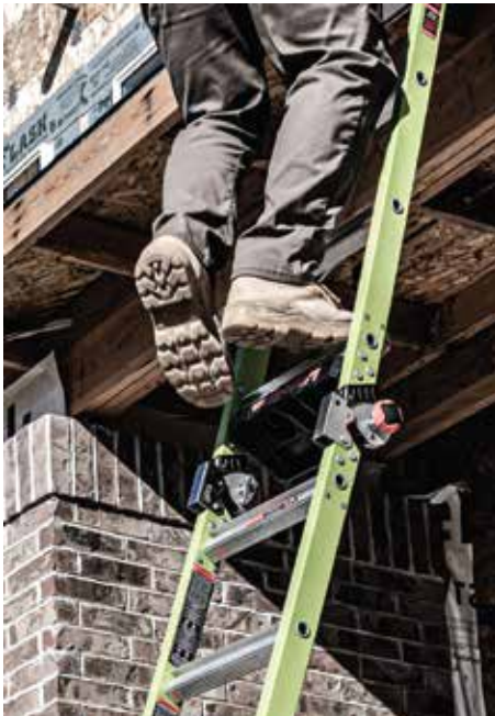
Tucks Under Rung While Ladder is Extended