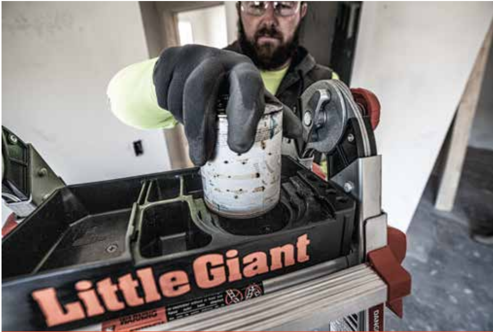
Friction Lock Depressions for Quart, Pint, and Gallon Cans