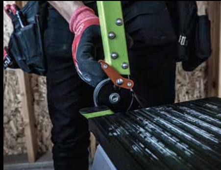
Quick-Release Rotating Hand Rail