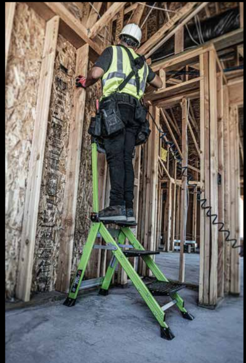
Get Closer to Your Work