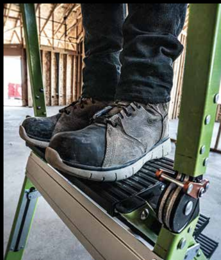
Wide Steps with Ridged Traction