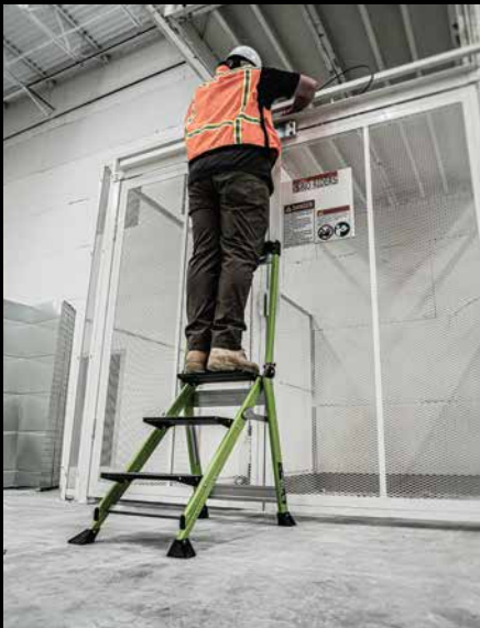
Stable Hand Rail