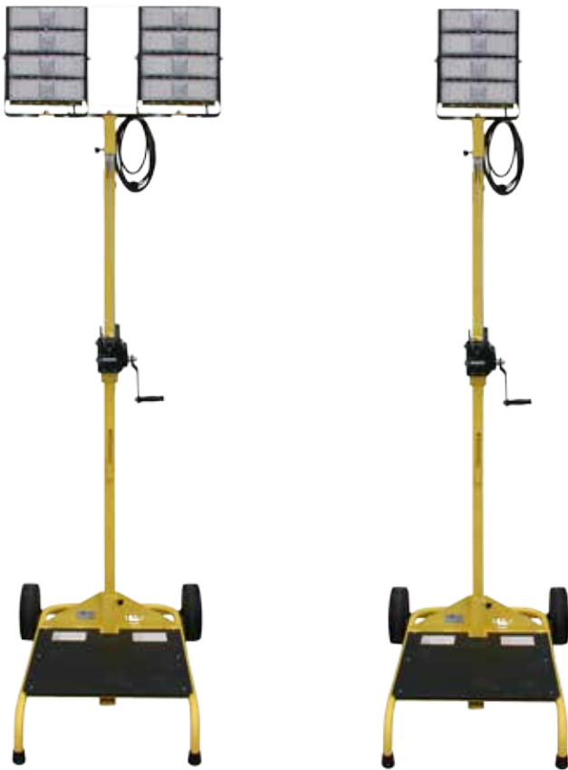
LE980LED-CART-TD-W Dual Head Cart with Winch