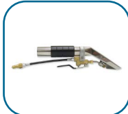
10-0501 4" Stainless Steel Upholstery Tool