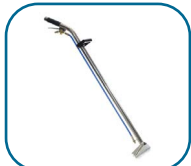
10-0455 Stainless Steel Spotter Wand with Blue 3000 PSI Hose and #2 Jet