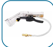
10-0500-E 4" Clear View Upholstery Tool (External)