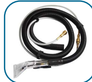
10-0401-E 4" Clear View Plastic Upholstery Tool with External 7 Ft. Hoses (for Non-Heated Units)