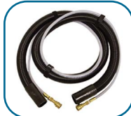
10-0450-A 7 Ft. Vacuum and Solution Hoses (External)