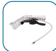
10-0500-I 4" Clear View Upholstery Tool (Internal)