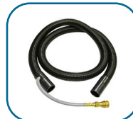
10-0450 7 Ft. Vacuum and Solution Hoses (Internal)