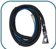
10-0503 4" Stainless Steel Upholstery Tool and 7 Ft. External Vacuum and Solution Hoses