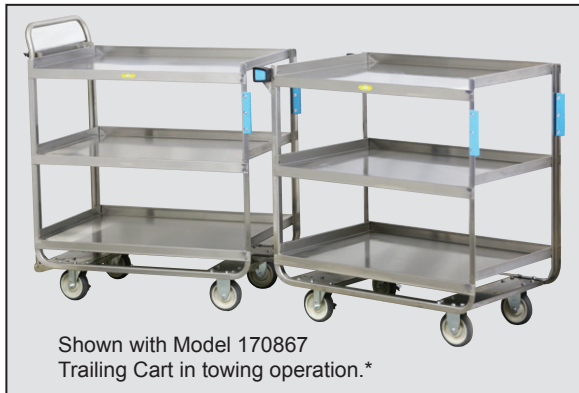
Shown with Model 170867 Trailing Cart in towing operation.*