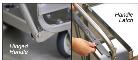
Push-Pull Handle 1 allows for safe pushing/pulling operation. Hinged handle locks securely in upright position.