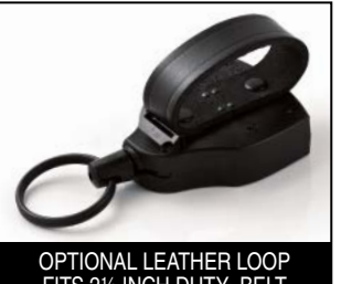
OPTIONAL LEATHER LOOP FITS 2¼ INCH DUTY BELT