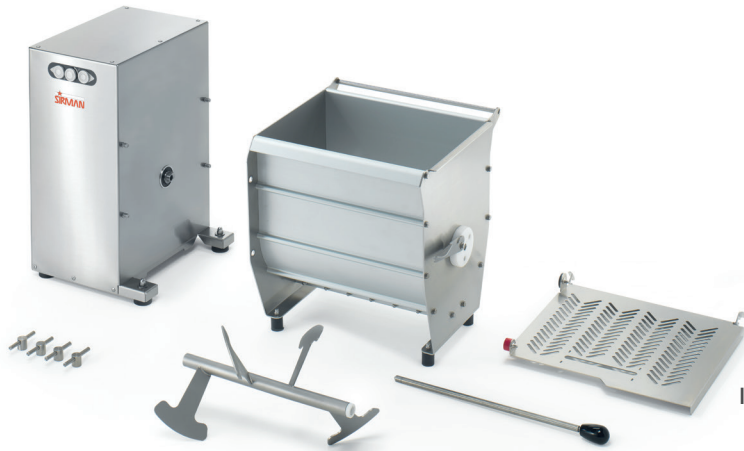
IP 30L RT