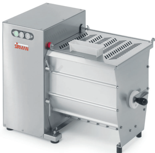
IP 30L RT