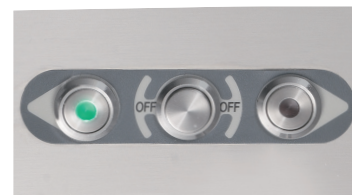
ON / OFF / REV stainless steel keypad IP 67 waterproof protection No voltage release