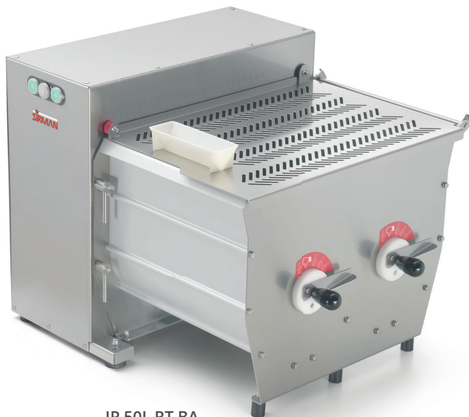
IP 50L RT BA