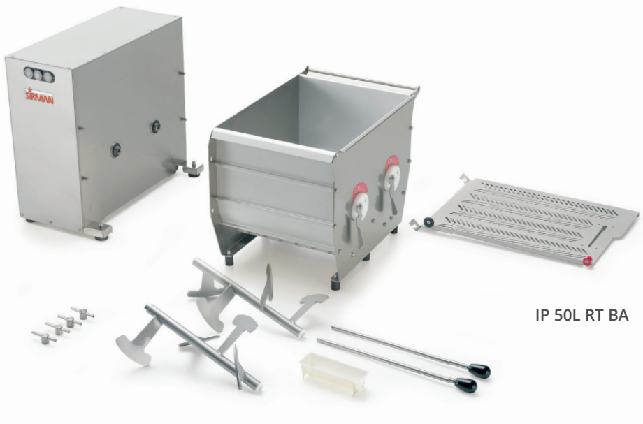
IP 50L RT BA