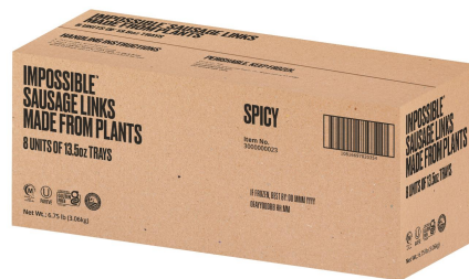
Figure B. Case