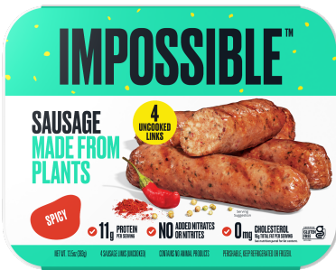
Figure A. Unit