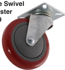
Heavy Duty Polyurethane Swivel Plate Caster 73819

Air baffle and circulating air blower provide even heat distribution.