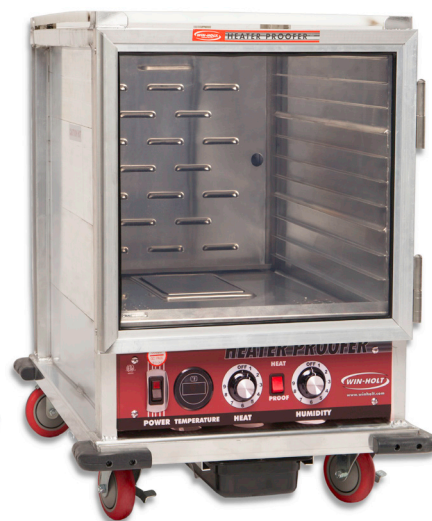
NHPL-1810HHC Fits under counters and tables.

For replacement parts please see page 143.