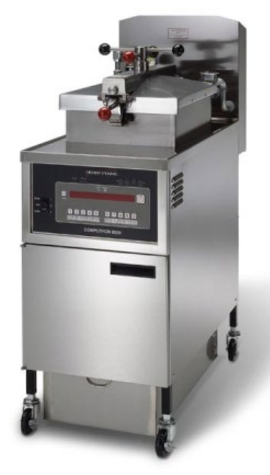
PFE 500 electric pressure fryer with Computron<sup>™</sup> 8000 control

Henny Penny first introduced commercial pressure frying to the foodservice industry more than 50 years ago. Frying under pressure enables lower cooking temperatures for longer oil life, and faster cooking times to meet peak demand. Pressure also seals in food's natural juices and reduces the amount of oil absorbed into product.