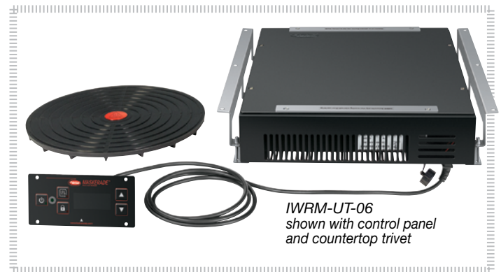
IWRM-UT-06 shown with control panel and countertop trivet