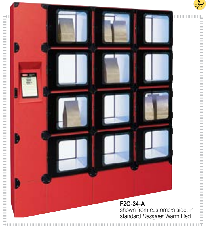
F2G-34-A shown from customers side, in standard Designer Warm Red

Project _____ Item # _____ Quantity _____