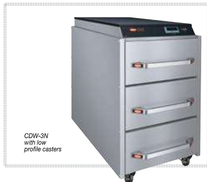
CDW-3N with low profile casters